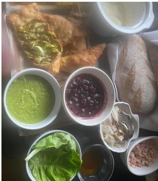
Arrow making and good food.