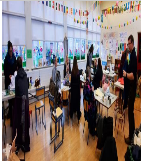
Garb making. Fencing didn't happen, everyone wanted to make their garb.