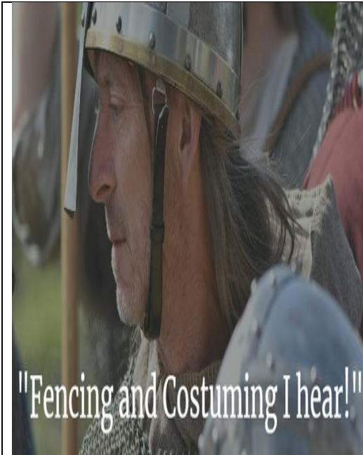
Cluai Ori in Galway