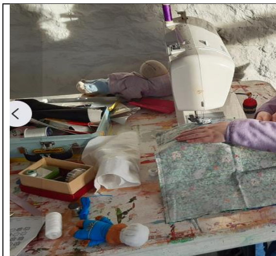
Tir Clroi Sewing day